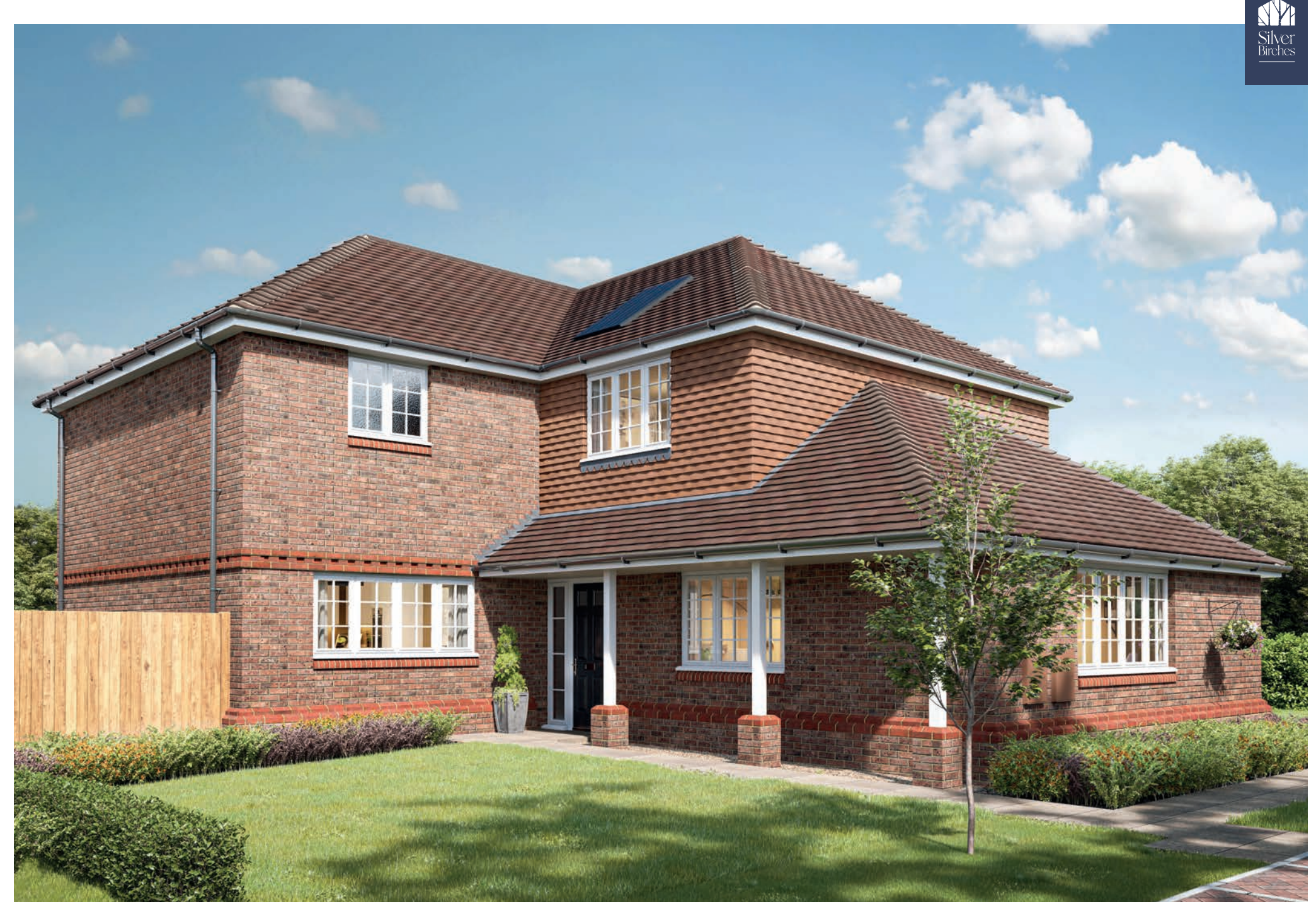
CGI shows The Manor ~ Plot 4