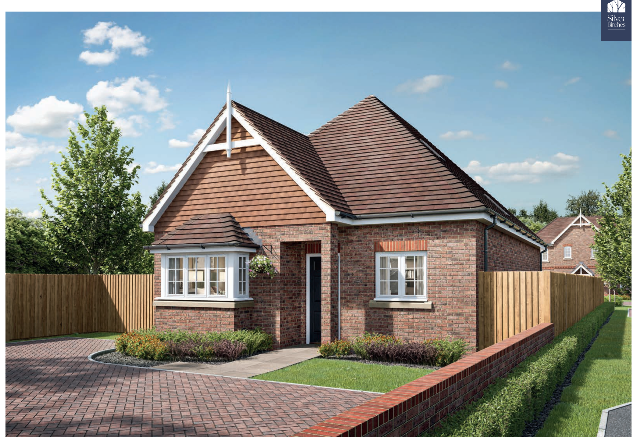
CGI shows The Laurels ~ Plot 1