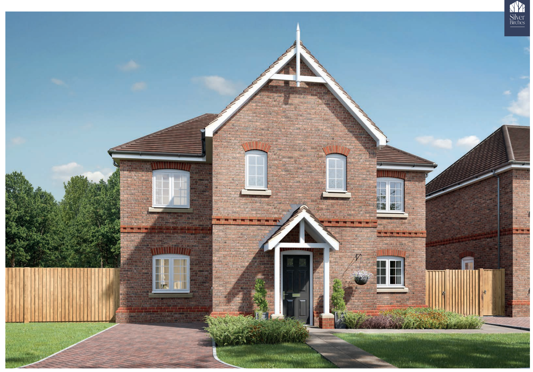
CGI shows The Haven ~ Plot 2