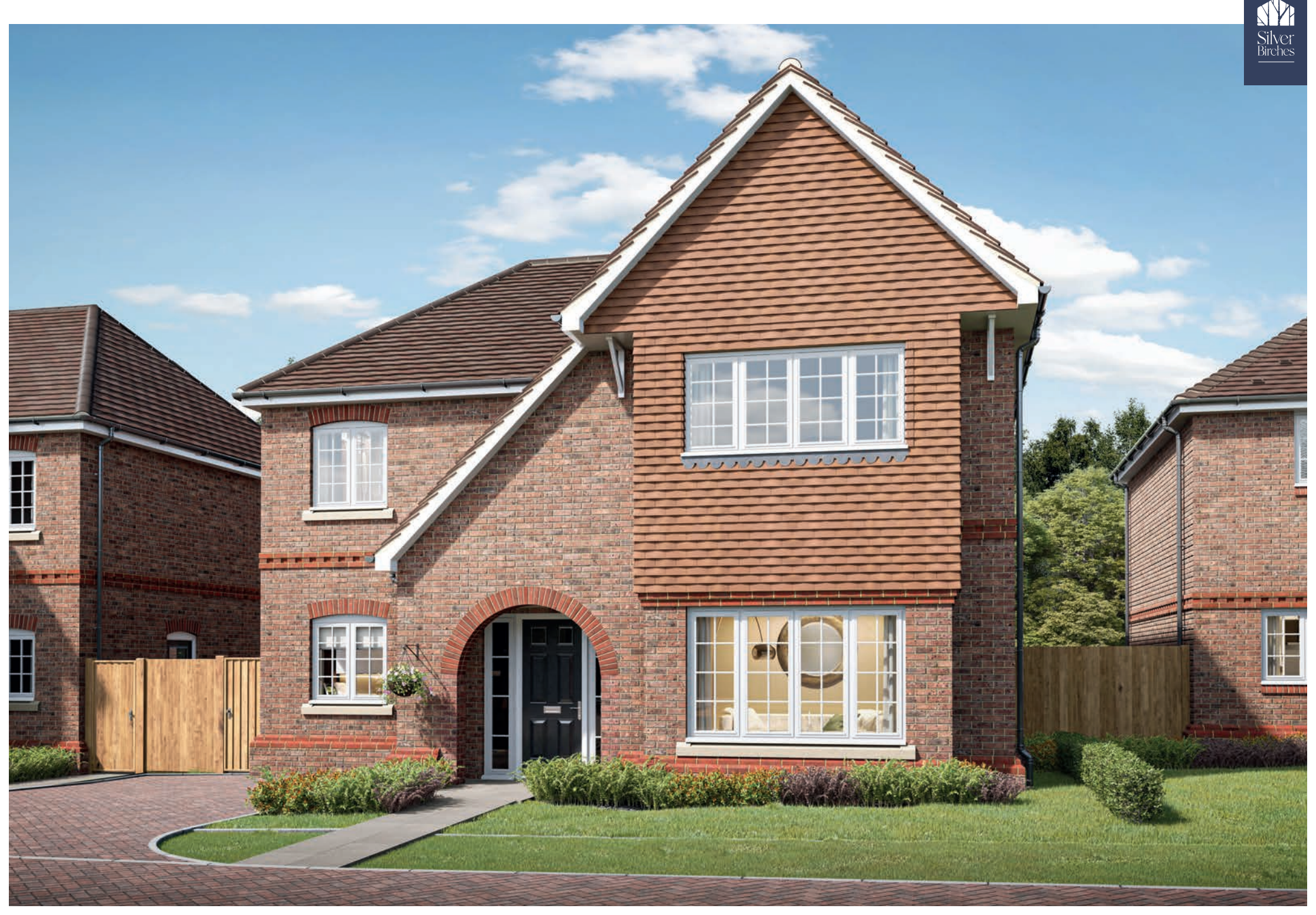
CGI shows The Retreat ~ Plot 3