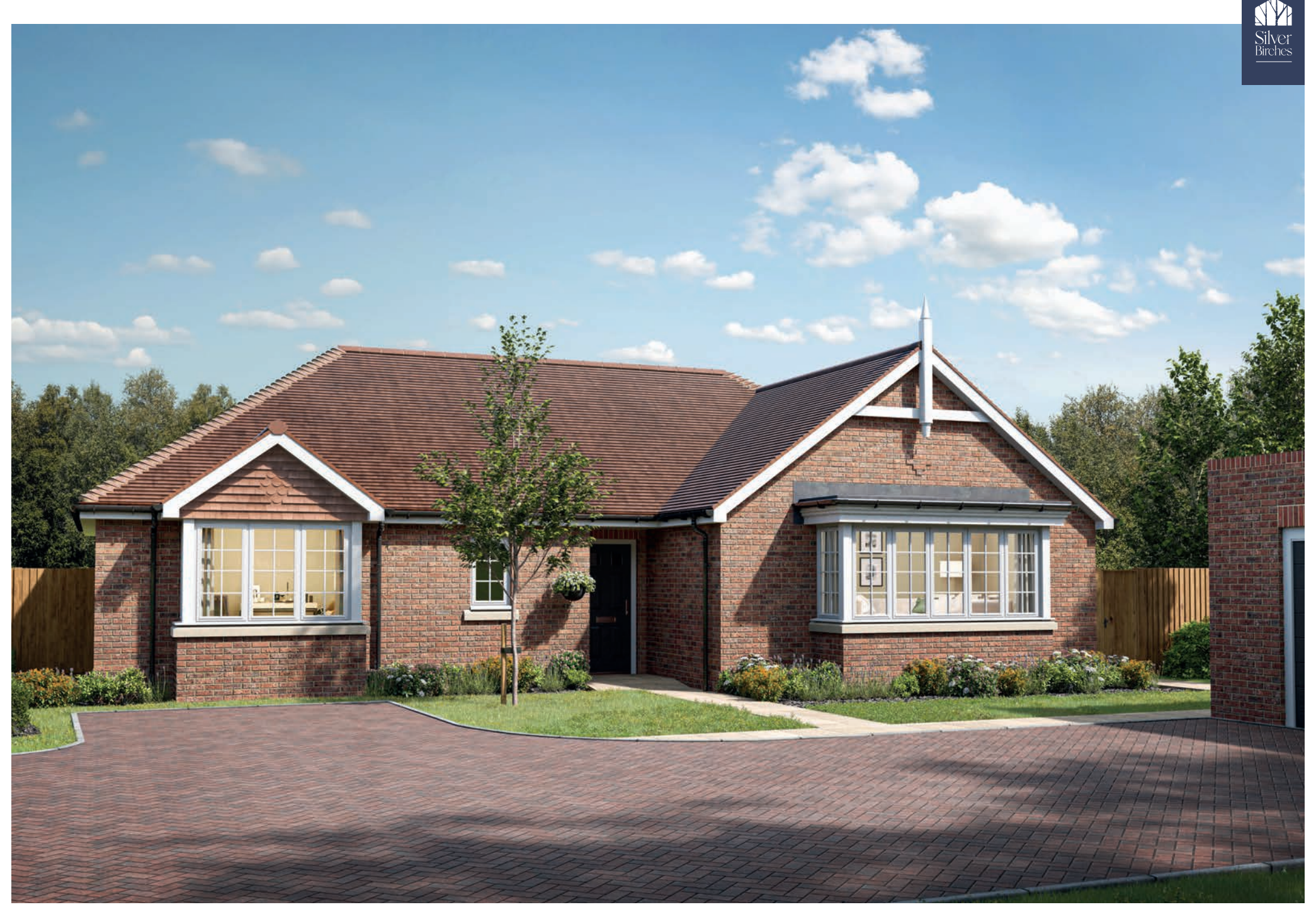
CGI shows The Willow ~ Plot 5